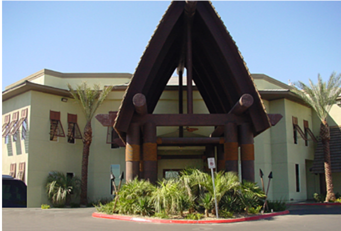
Completed view of The Tahiti Resort on Tropicana, Las Vegas, NV