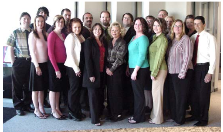
Our CivilWorksInc team ready to serve YOU on your next project!

CivilWorksInc has an exceptional understanding of " Multi-Family " facility developers, users, and their needs, and has an energy and dedication to help you succeed.