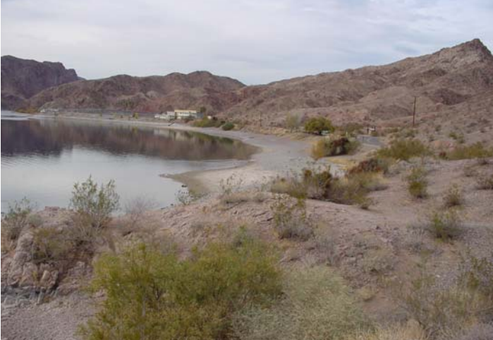
A view of " Willow Beach " area near Boulder City, Nevada.