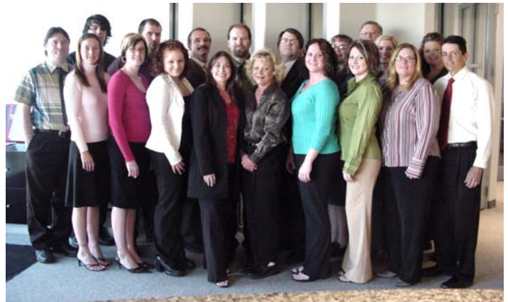
Our CivilWorksInc team ready to serve YOU on your next project!

CivilWorksInc has an exceptional understanding of " Office Building " facility developers, users, and their needs, and has an energy and dedication to help you succeed.