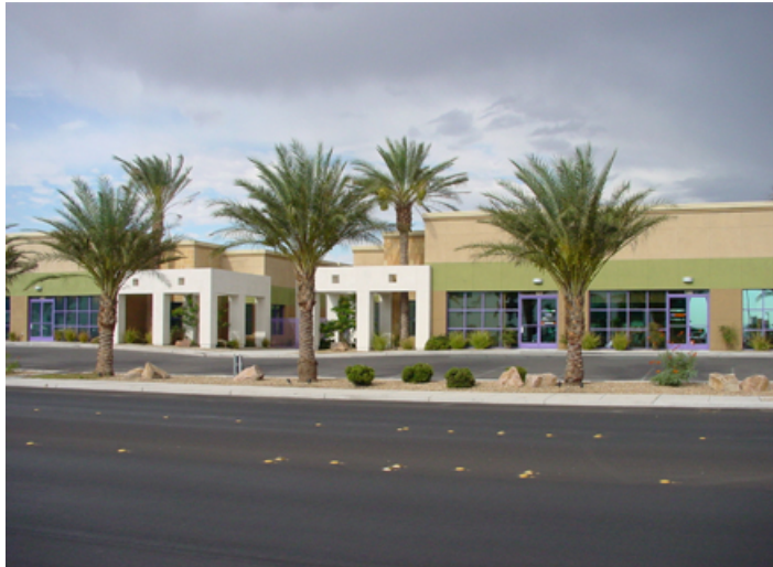
A view of Freeway Office Park @ Dean Martin Drive in Las Vegas, Nevada.