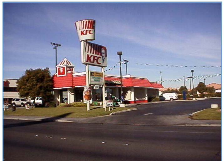
One of our many commercial pad jobs: KFC @ Maryland and Silverado Ranch in Las Vegas, Nevada

CivilWorksInc 1 has an exceptional understanding of " Commercial Pad " facility developers, users, and their needs, and has an energy and dedication to help you succeed.