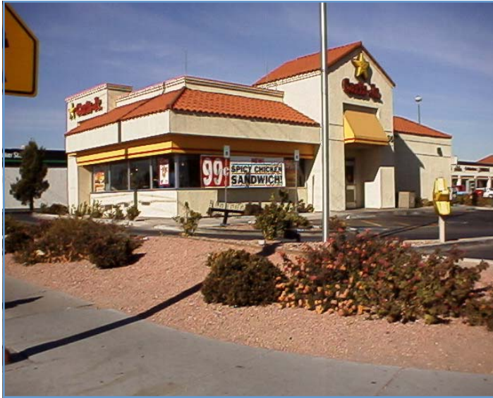
A view of Carl's Jr. Restaurant @ Sahara & Valley View in Las Vegas, Nevada.