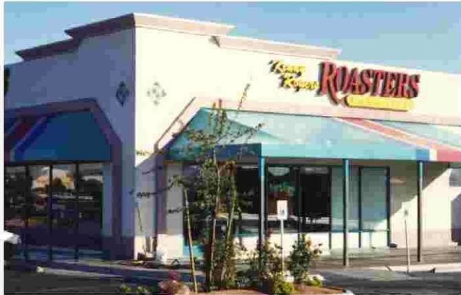
An view of "Kenny Rogers Roasters @ Cheyenne Commons Shopping Center" located in Las Vegas, Nevada.