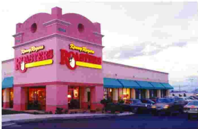
A view of "Kenny Rogers Roasters @ Westland Faire Mall" located @ Decatur Blvd. & Charleston Ave. in Las Vegas, Nevada.

Timeliness, Accuracy, and Budget are the critical watchwords in the provision of architectural services for the Kenny Rogers Roasters facilities. GGW Architect Studios focuses on timeliness, accuracy, and budget when providing architectural services for the preparation and delivery of drawings for the processing and construction of new Kenny Rogers Roasters installations.