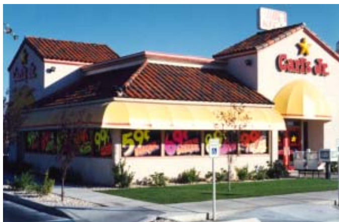
A view of "Carl's Jr. Restaurant" @ Cheyenne Commons Shopping Center located in Las Vegas, Nevada.