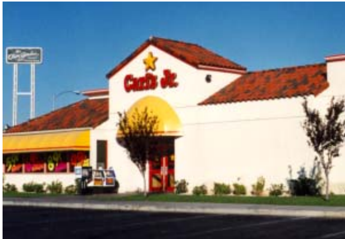
A view of "Carl's Jr. Restaurant" @ Cheyenne Commons Shopping Center located in Las Vegas, Nevada.